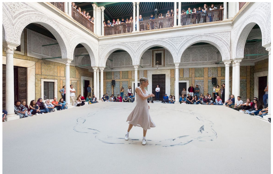
ATDK, © Pol Guillard

Their approach involved insisting on lengthy periods for the creation of artistic works in close harmony with the urban space of the Medina, a consideration of the local residents, expansion of the viewing public, and deeper integration of reflection into the artistic process. For the Dream City team, from the beginning, the idea was clear: “Art plays a vital role in educational, social and economic development, and the right to culture is a fundamental right, in the same respect as the right to health, education and justice.” Progressively with each subsequent presentation of Dream City, L'Art Rue team refined its methodology and its message, without deviating from the original intent. Dream City embraces its “laboratory”