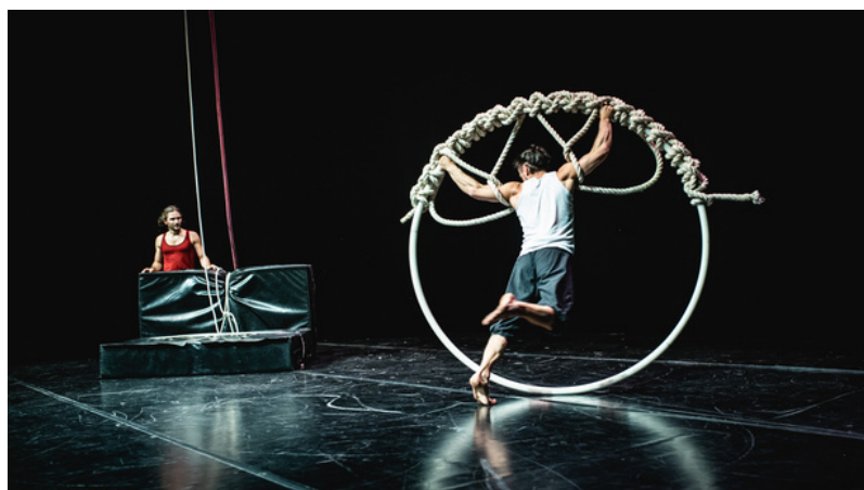
© Up to this point, Jaanar Nikker