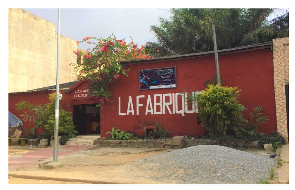
Outside view from La Fabrique Culturelle

Over the six years that La Fabrique has been in existence, we've supported young dance troupes as a co-producer. We set up partnerships with them, we provide them with free rehearsal and creative spaces, and in return they perform their premières at La Fabrique, for no performance fees. La Fabrique has never been awarded any grants or funding. Our economic model is entirely circular. We are self-funding, in particular through our partnerships with schools, as we're responsible for drawing up annual artistic programmes for schools that follow the French curriculum.