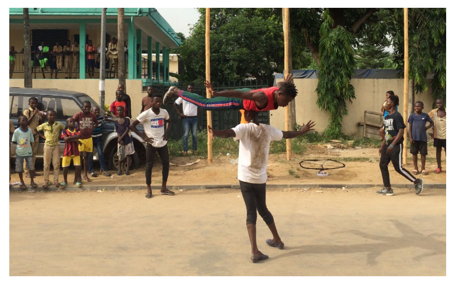
Ivoire Cirque Décalé company in front of La Fabrique Culturelle

Despite aspiring to create shows and productions, these teams struggle to find the right partners, and means of production are severely lacking across the continent. Consequently, many circus performers often some of the most talented – head for Europe, Canada or the United States to pursue their careers. Over the past thirty years, countries such as Guinea-Conakry