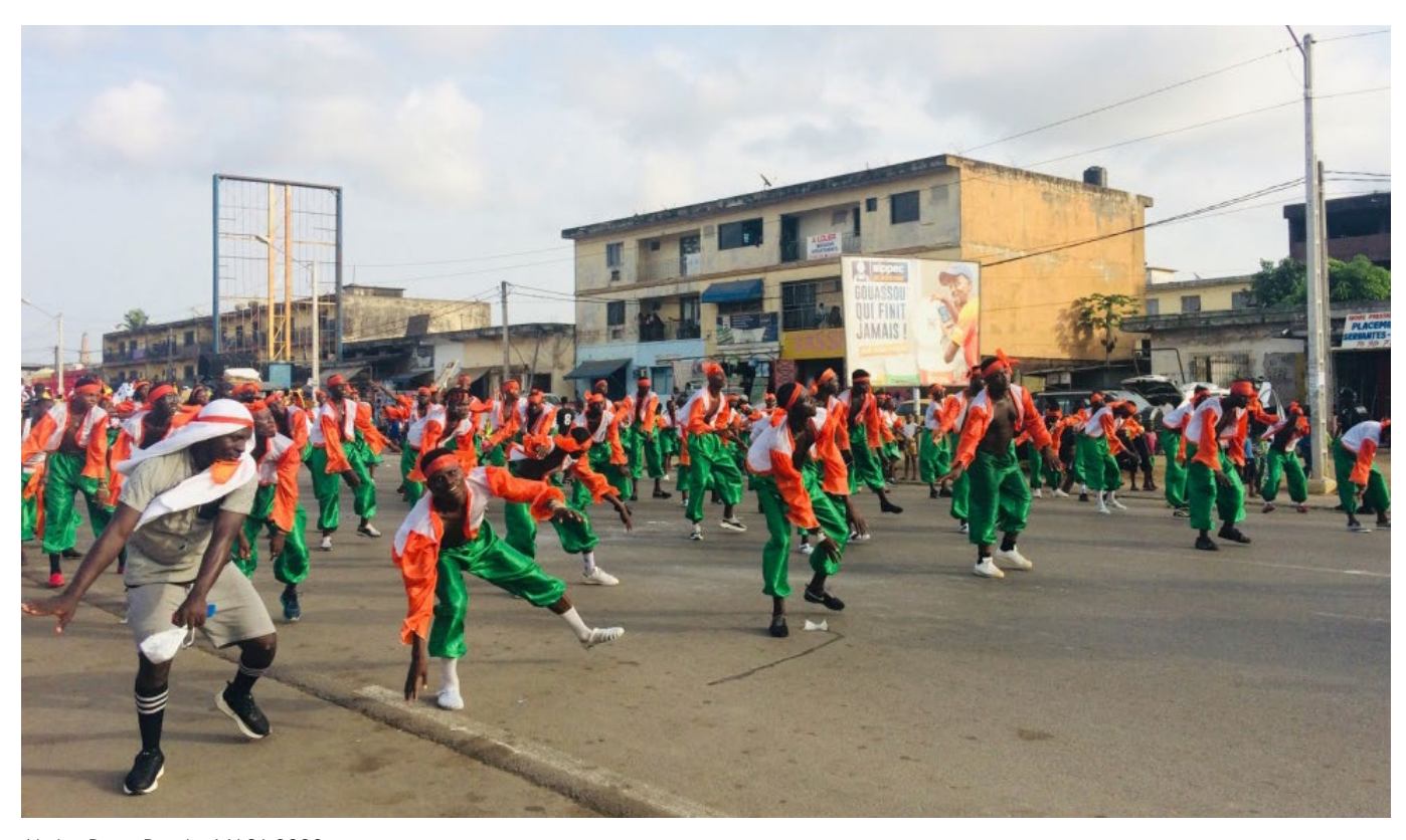
Abidjan Danse Parade - MASA 2020

Rabat is the first African Capital of Culture. Originally scheduled for 2020, the Covid-19 pandemic has forced the Moroccan authorities to postpone Rabat to 2021. Despite the wait, this freshly launched cycle of culture capitals serves as proof of the new emphasis Africa's local authorities and their partners are placing on culture.