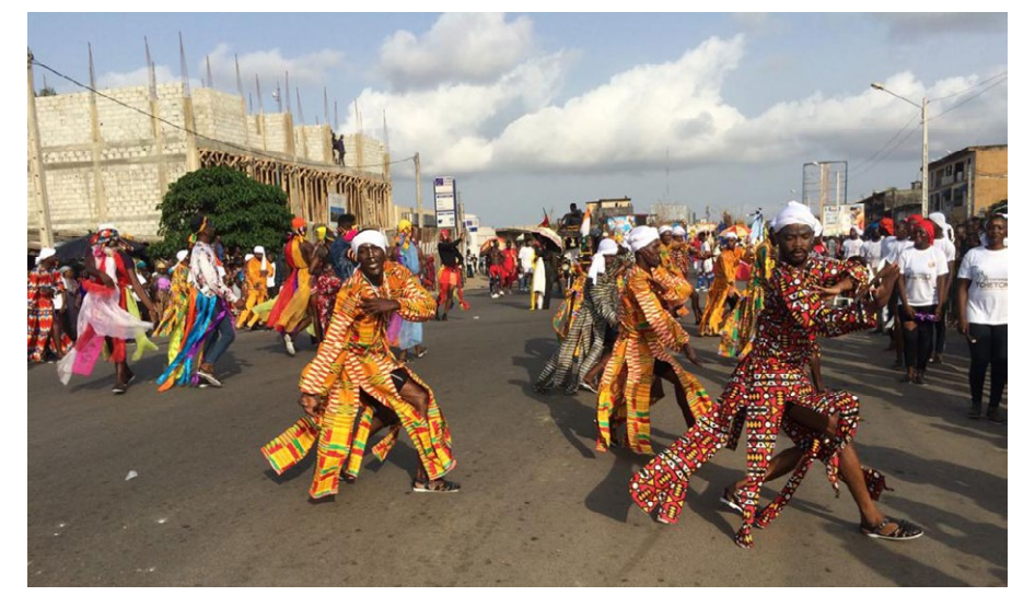
MASA opening parade in Abobo

When night falls over Le Plateau, the business district nicknamed 'Little Paris', or 'the Manhattan of the Tropics' on the Ébrié Lagoon, the air fills with the beating wings of thousands of bats. Just a few weeks later, their starring role in the Covid saga would be revealed.