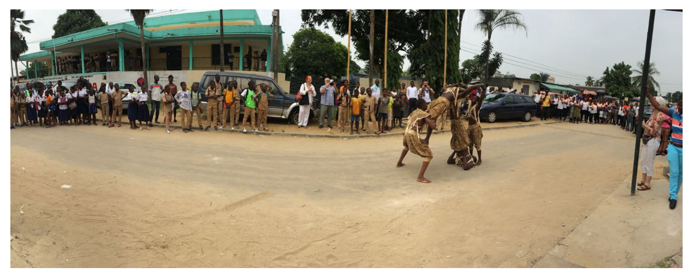
Circus Dafra and Faso Cirque artists (Burkina Faso) in front of La Fabrique Culturelle

Internet and digital communication, circus performers – whether clowns, acrobats, dancers or musicians – are at the epicentre of the developmental challenges faced by the African continent today. Participating artists at the RICA and MASA are their spokespeople. The KAHWA#3 events, and the creative and unifying projects that are emerging from within them, are a highly positive and exciting sign of a landscape in the making.