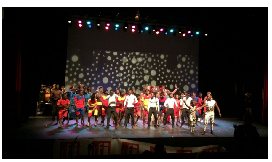
The artists who performed No Limits on stage during the premiere at the RICAs

In March 2020, the No Limits premiered as part of the RICA: a flamboyant, dazzling whirlwind show that Georges Momboye developed alongside thirty-odd circus performers, with 80% of the artists hailing from Ivory Coast, and 20% from Ghana, Guinea-Conakry and Ethiopia. His goal is to take the show on tour in Africa and around the world.