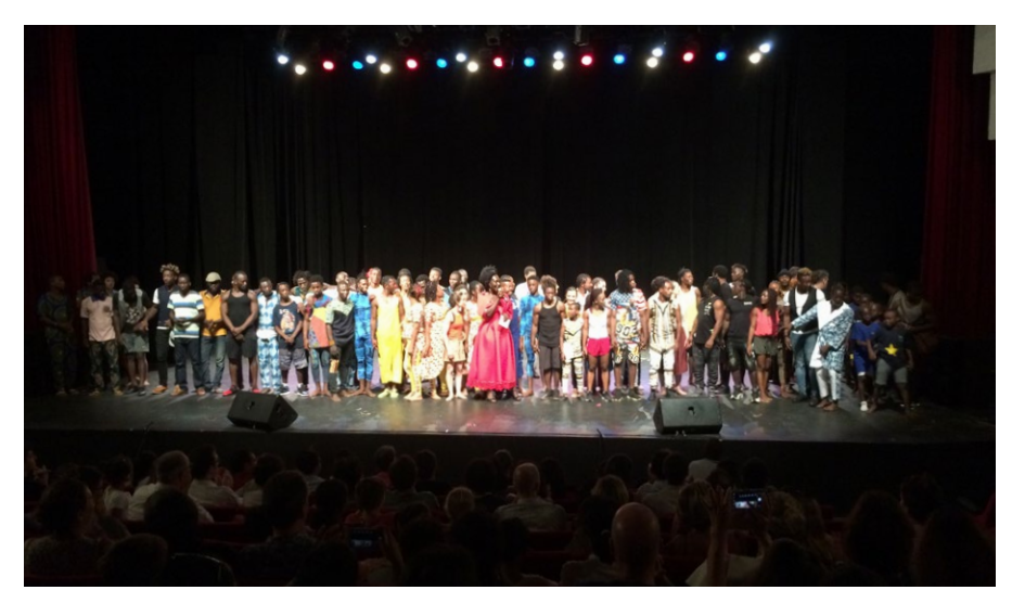
All the artists scheduled at the RICA during the opening night on the main stage of the French Institute

The next morning, we set off for the Fabrique Culturelle at Les Deux Plateaux in the Co-