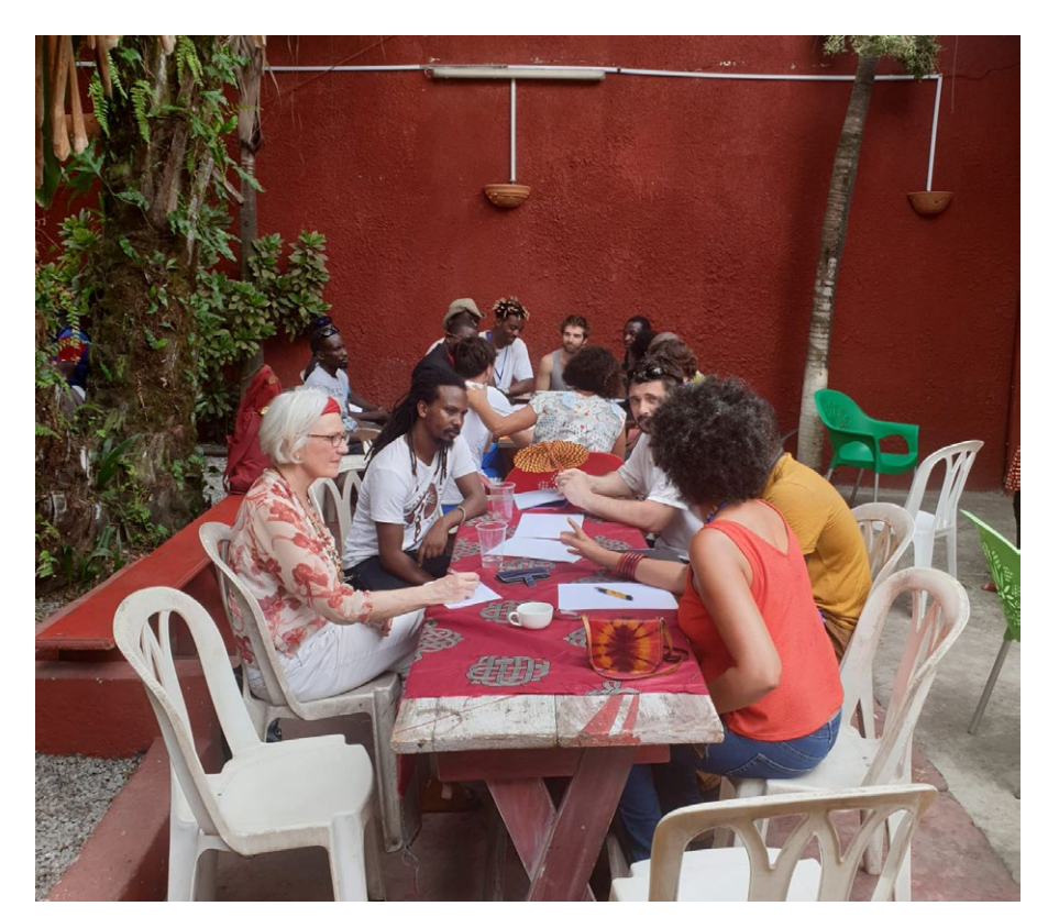
KAHWA workshops at the Fabrique Culturelle

It is now essential to set up a pan-African network. This is key to pooling skills and knowledge, improving communication and showcasing, and building performers' networks. If we don't set up this network or "federation" - I'm not yet sure what we'll call it - we run the risk of turning inwards, everyone homing in on their own region or country. To prevent that from happening, this network will get us all working together, and enable productions to tour from one country to another. The network could also work as a resource centre. As things currently stand in Africa, how do you find out if there's a festival running in Senegal or Ethiopia? The network should include a platform of resources, an inventory of all the information available on