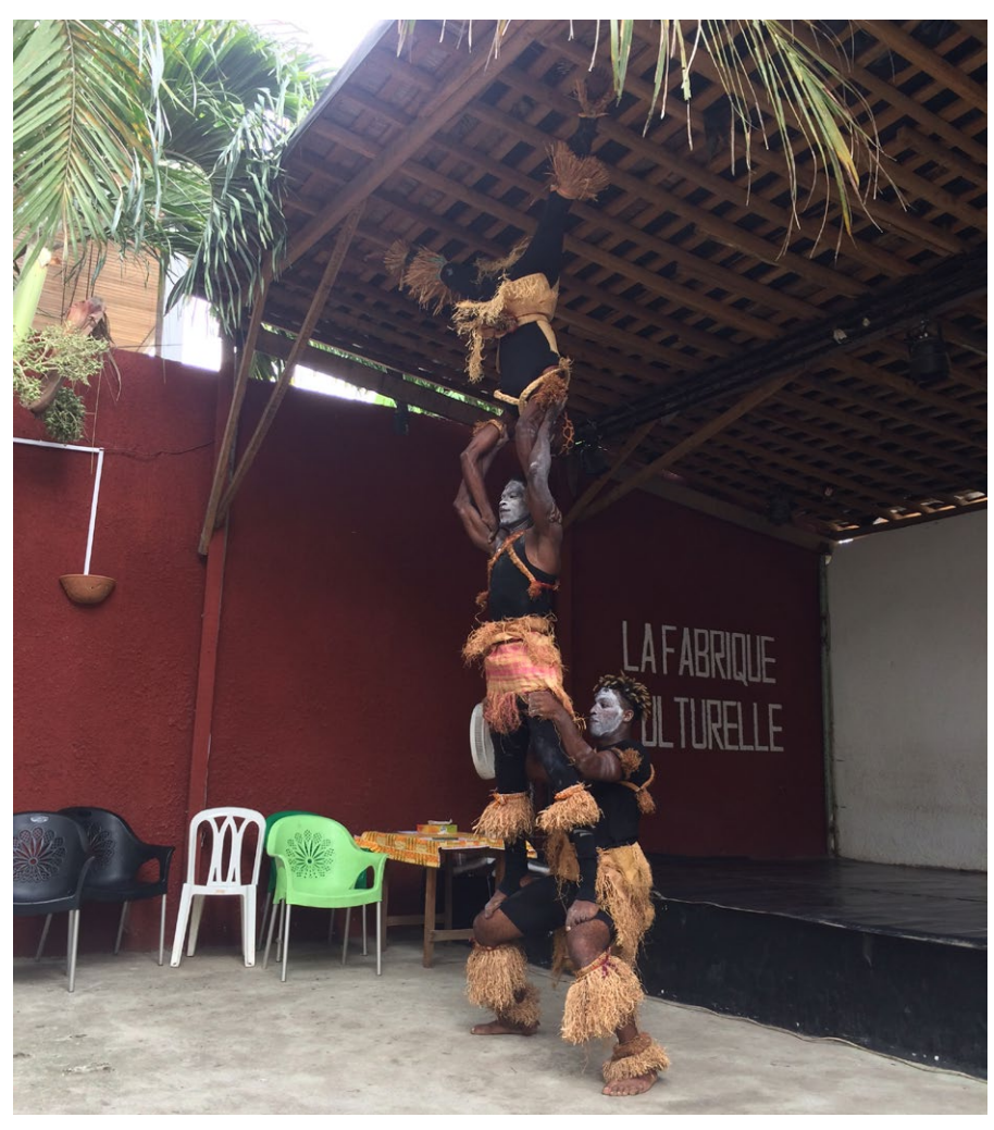
Artists from Cirque de l'Equateur (Libreville, Gabon)

One tangible, clear positive to come out of this third edition is that Ivory Coast now has its own national circus company, and smaller circus companies are popping up. Some dance companies, and particularly urban dance troupes, are saying: "Guess what? We do circus now." And that's really the RICA's legacy.