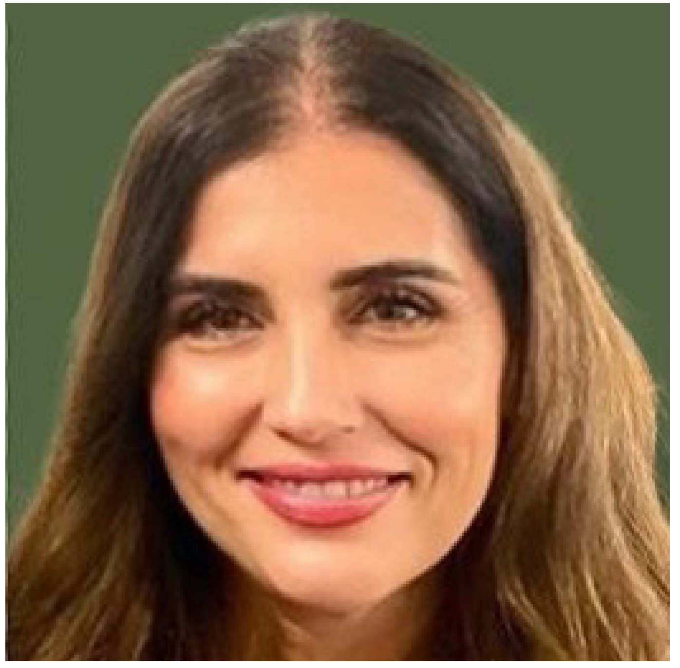
OMRCEN ROMANA EXTERNAL GUEST INSTITUT FRANÇAIS CULTURAL AND COMMUNICATION OFFICER CROATIA