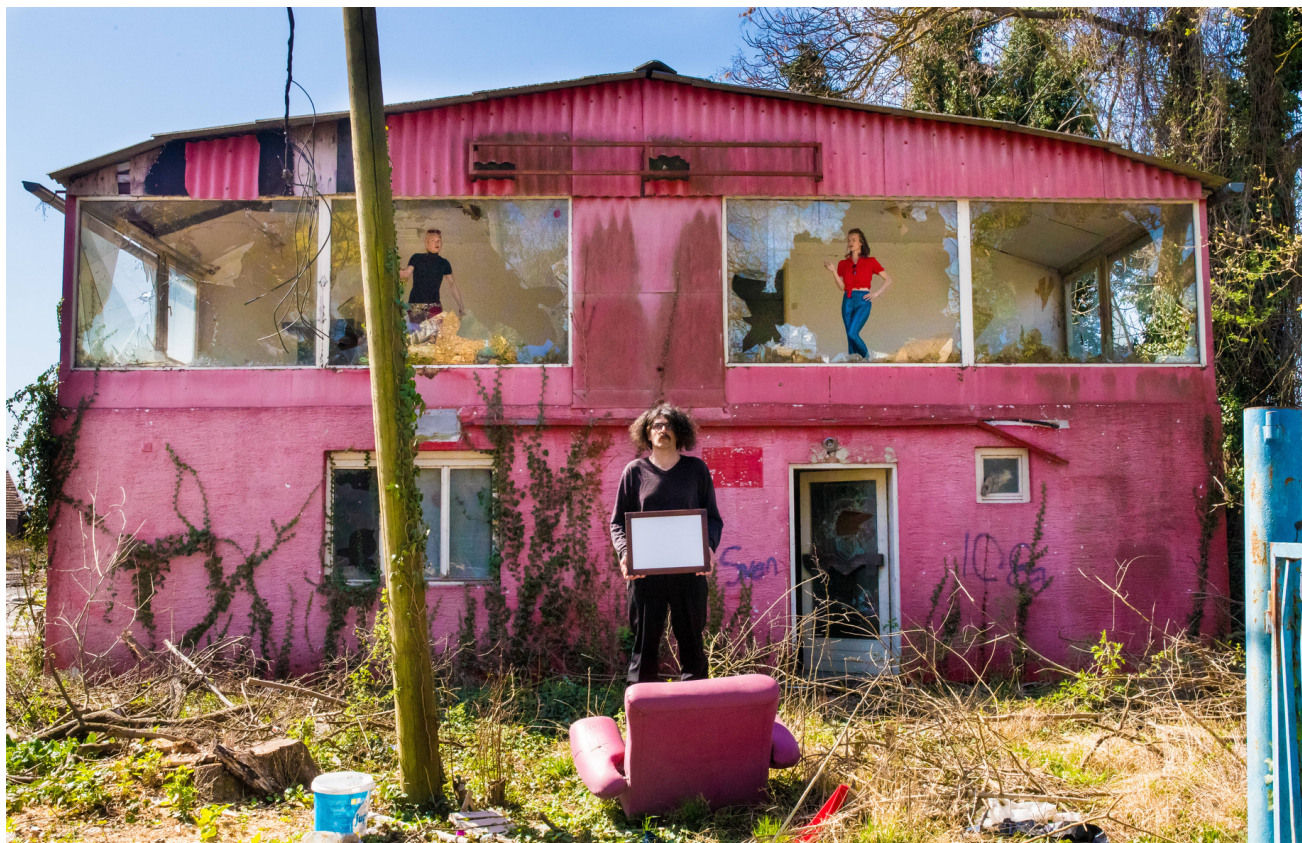
This could be a circus