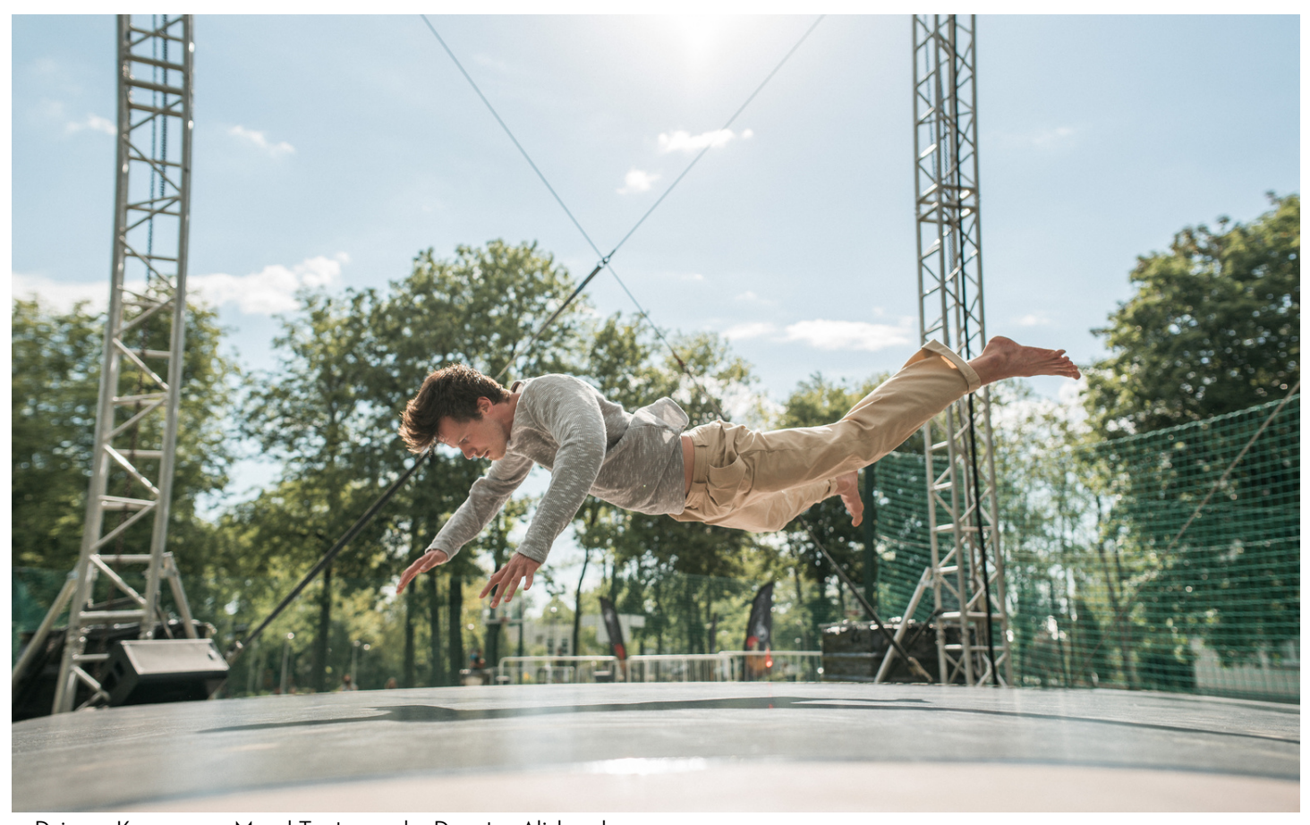
© Dziugas Kunsmanas_Mood_Teatronas by Donatas Aliskauskas