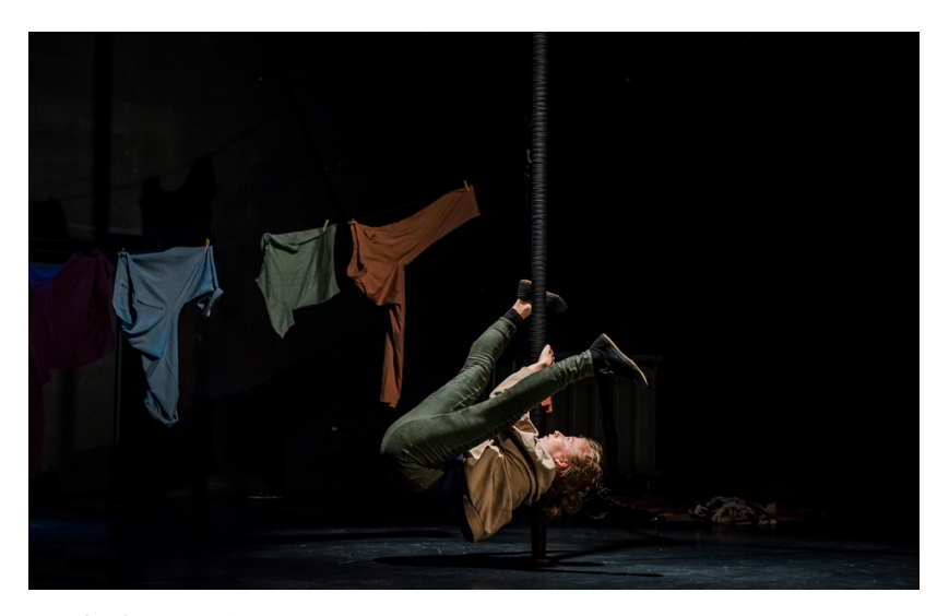
© Clothes and Us, Dainius Putinas